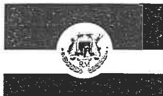
10th Anniversary of the Republic of MAURITIUS Official First Day Cover