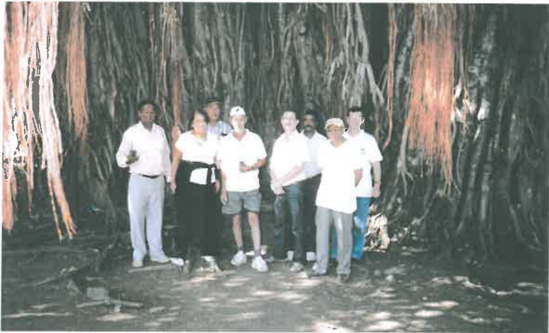
Under the Banyan Tree at Rivière Noire - Photo Mico Antoine, May 2010

On May 15 th 9 members out of the 13 who had signed up for the trip to the south west of the island met well after the scheduled time as usual, at the rendezvous point, Guy Rozemont Stadium, La Louise. In three cars the group headed for Riviere Noire, Varangue-sur-Morne, Black River Gorges Viewpoint, Grand Bassin, Mare-aux-Vacoas and finally back to the starting point.