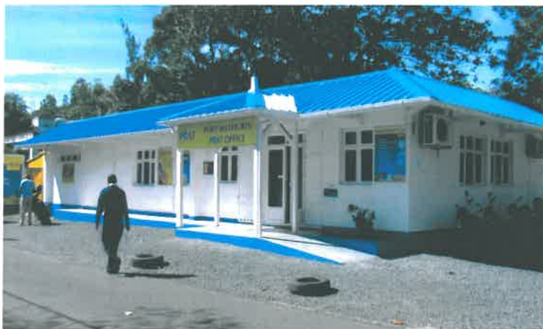
August 2010

The new post office of Port Mathurin, Rodrigues, located at Solidarity Street, opposite Rodrigues College, Junior Department which opened for business on Monday 22 nd February 2010, was officially opened on Wednesday 14 th July 2010 by the Minister of Information and Communication Technology and the Minister of Fisheries and Rodrigues and the Chief Commissioner of Rodrigues Regional Assembly in the presence of other eminent personalities as well as the Chairman and Chief Executive Officer of Mauritius Post Ltd.