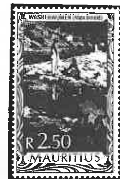
Past Flowers, Giant Tortoises and Painters of Mauritius