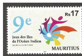
9 e Jeux des Iles de l’Océan Indien