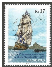
300 th Anniversary of the French Landing in Mauritius (1715–2015)