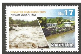
Disaster Risk Reduction