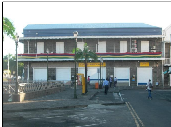
Sir William Newton Street