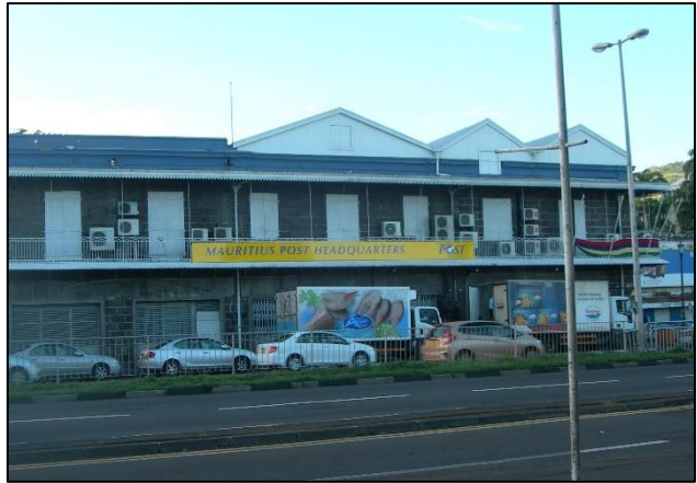
MPL HQ Port Louis