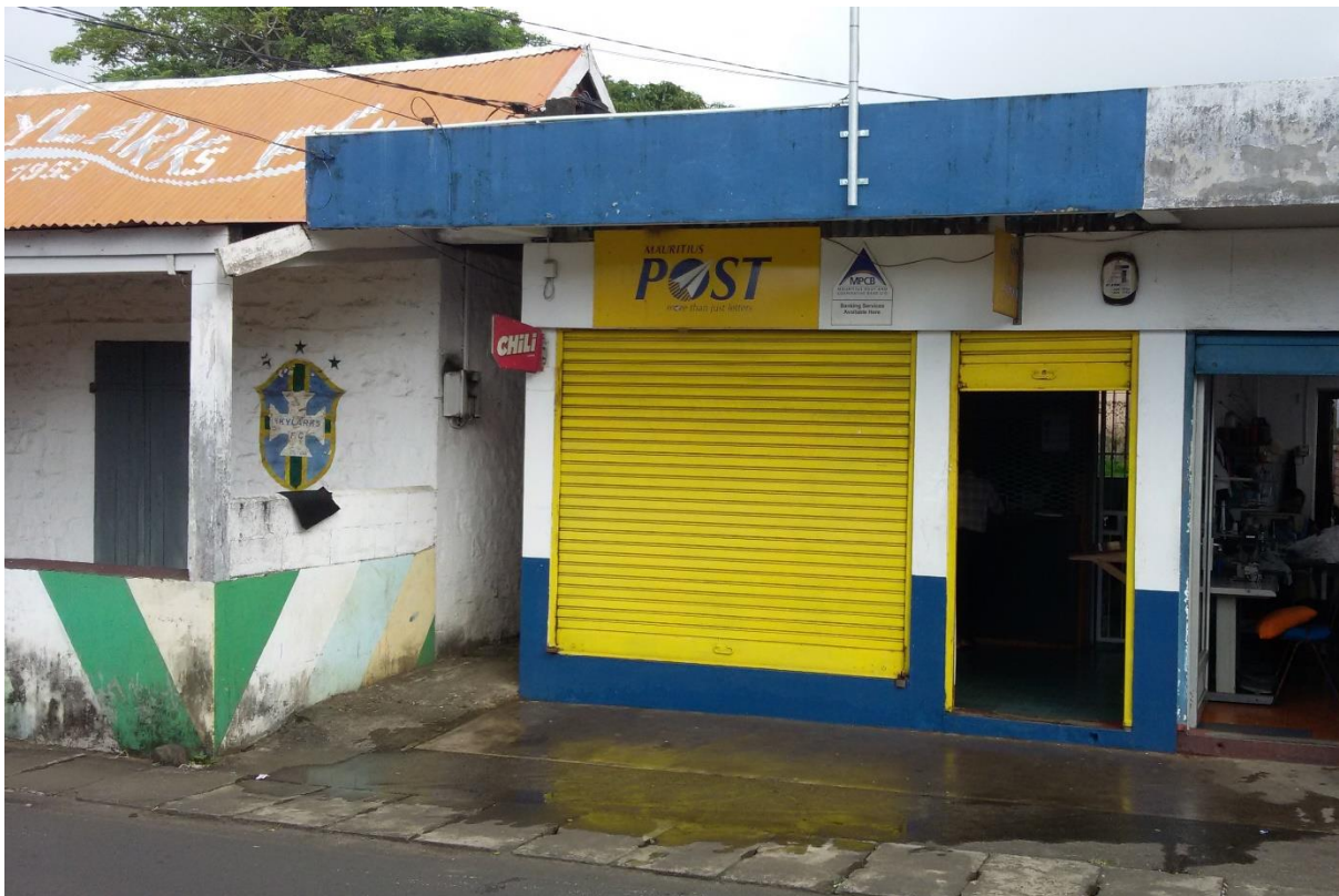
May and June convocations were posted on 27 th April 2016 from Camp Diabie Post Office.

The notice board carried news and press cuttings on postal matters, some amusing digital franking abbreviations and varieties and a “Missent to Jamaica” from the UK to Mauritius post card of April 2016.