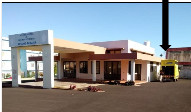
Municipal Council of BB/RH Funeral Parlour

The third Mobile Post Office 3 van will park in the yard of the Beau-Bassin/Rose Hill Municipal Funeral Parlour adjacent to the Camp Levieux Police Station to serve only Camp Levieux customers whilst Mauritius Post hibernates to "contemplate" serving other localities in the "near future". When not at Camp Levieux the van parks at its base – Stanley Post Office. The society has it that the "near future" localities will be Barkly, Palma and Roches Brunes.