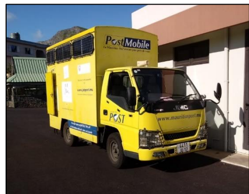
Mobile Post Office 3